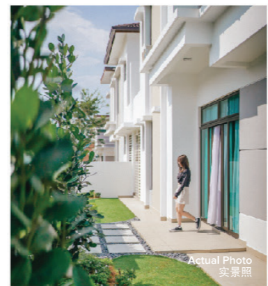
Actual Photo 实景图