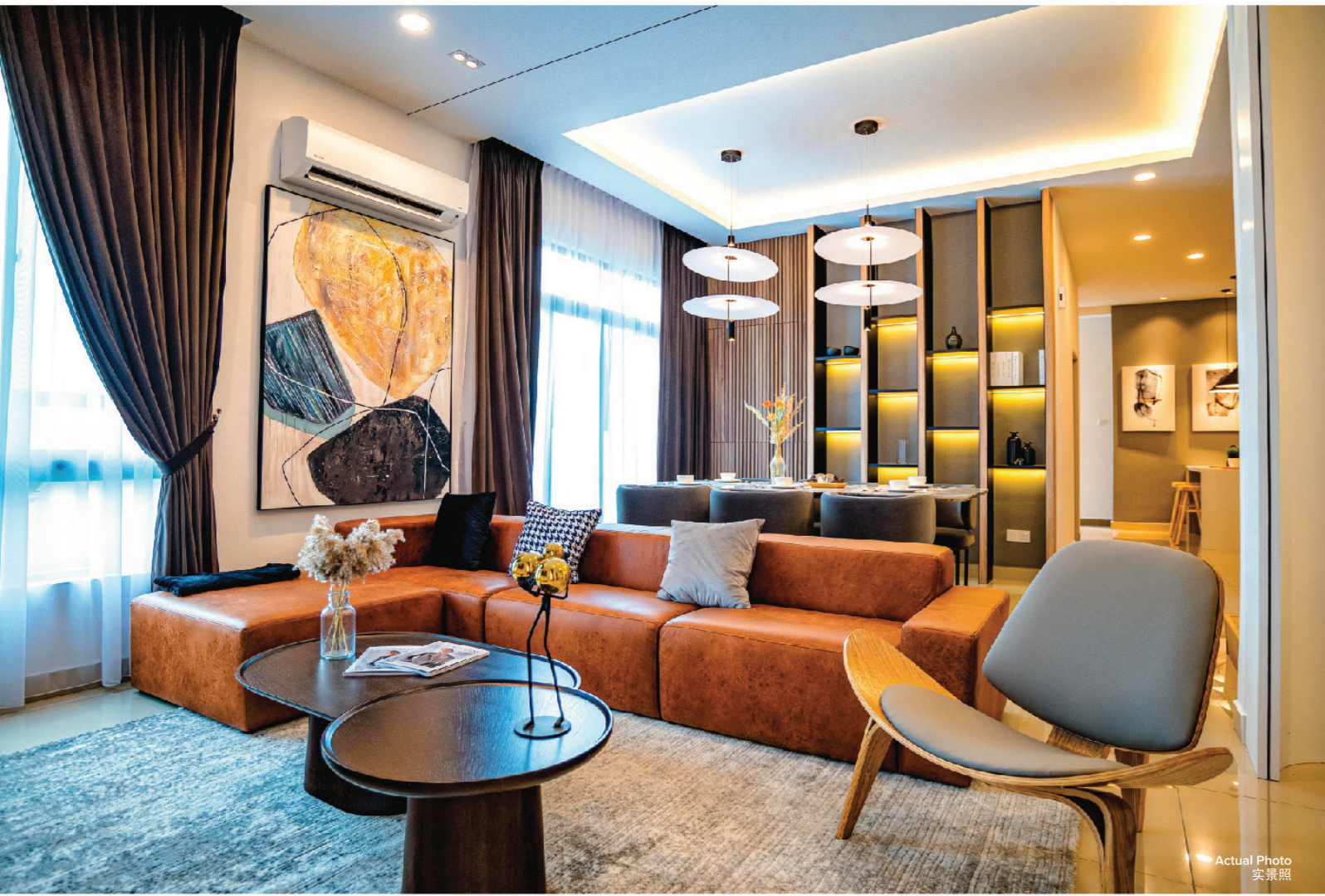
Actual Photo 实景图