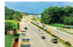
Johor Bahru - Kota Tinggi Highway 新山 - 哥打丁宜高速公路