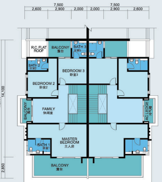
First Floor 一楼平面图