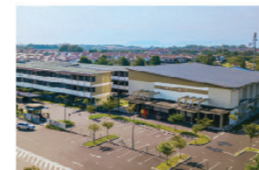
Mawai Chinese Primary School 马威华文小学