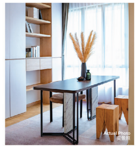
Actual Photo 实景图