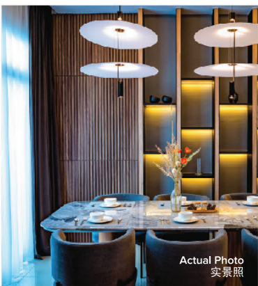
Actual Photo 实景图

在Precinct Nilam 3的安逸社区中, 我们致力于为您打造一个安心、舒适和宽敞的居住环境。我们为每个家庭成员提供独立的生活空间, 让您和家人尽享惬意生活。温馨的氛围, 实现您对家居生活的所有期望。