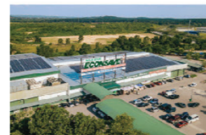
Econsave Hypermarket 宜康省霸级市场

Precinct Nilam 3 位于哥打丁宜的核心地段，邻近各个基本设施、主要城市 and 高速公路。