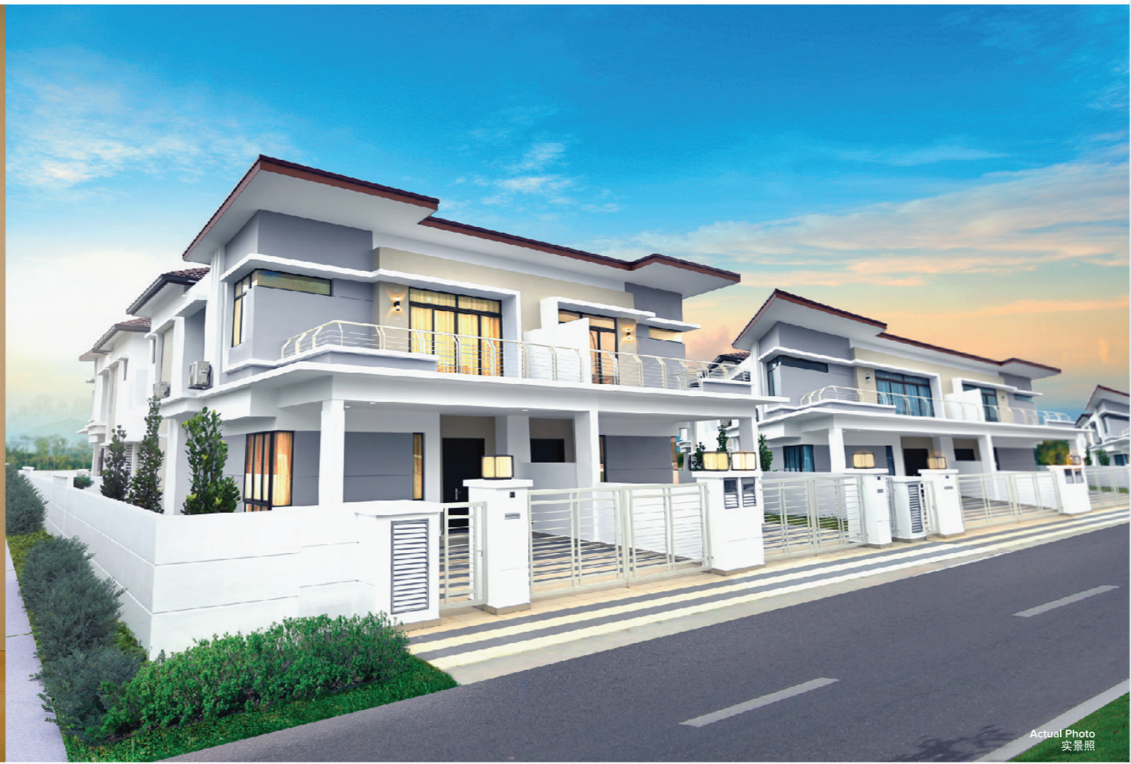
Actual Photo 实景图