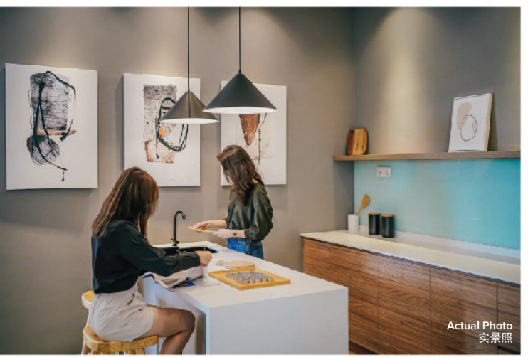
Actual Photo 实景图

Notice: The event of a conflict of interpretation, all specification etc. stated in english language shall prevail. 备注如有任何陈述不准确, 请参阅英文为准。