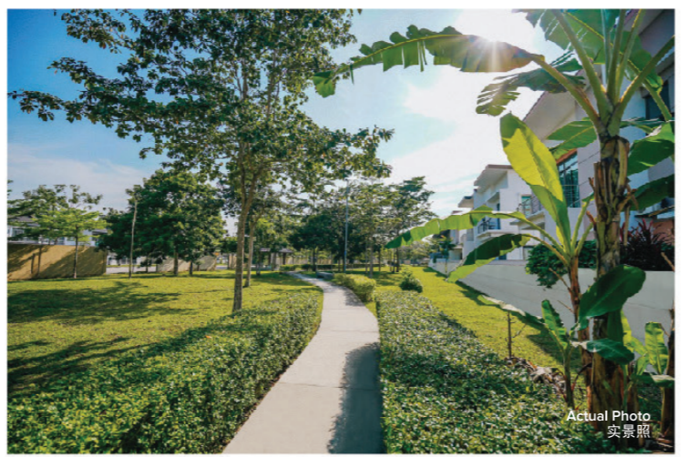
Actual Photo 实景图